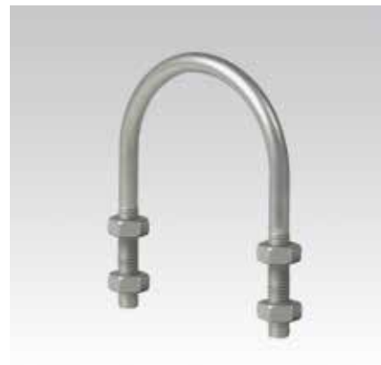
Versions M16 to M20 with nuts