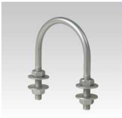
Versions M8 to M12 with nuts and washers