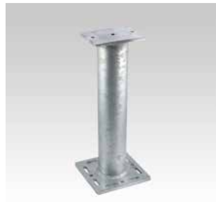
MPT 240x240+200x140, D114.3