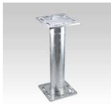
MPT 240x240+240x240, D114.3