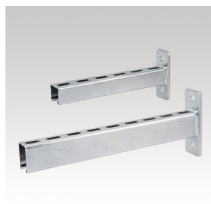
Wall hanger brackets with VdS certificate