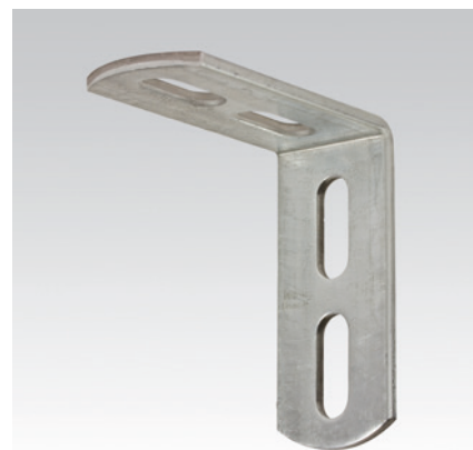
Mounting angle 90°, type 3, light