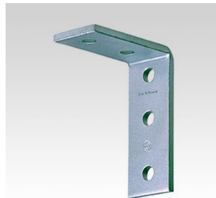
MPC-Mounting angle 90°