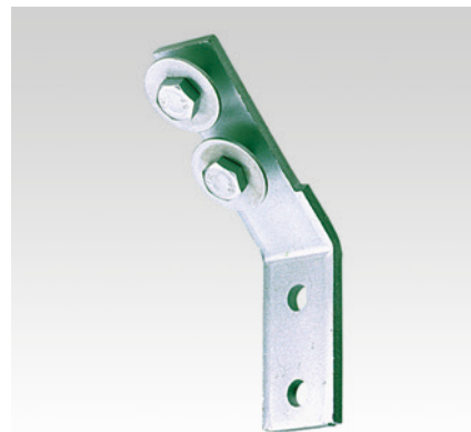
MPC-Mounting angle 45°